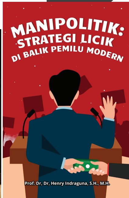
Manipolitik: Strategi Licik di Balik Pemilu Modern