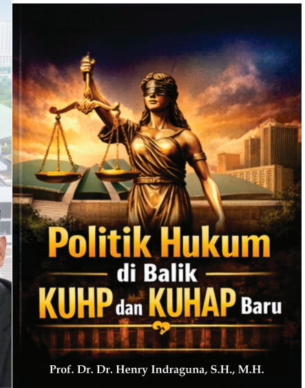
Politik Hukum di Balik KUHP dan KUHP Baru