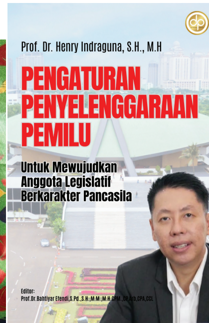
Pengaturan Penyelenggaraan Pemilu untuk Mewujudkan Anggota Legislatif Berkarakter Pancasila